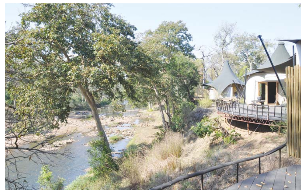
FROM LEFT TO RIGHT: The magnificent Bengal tiger, the gaur, which is the largest bovine species in the world, and a private viewing deck in one of the tented suites of Bazaar Tola Lodge. (Irving Spitz)